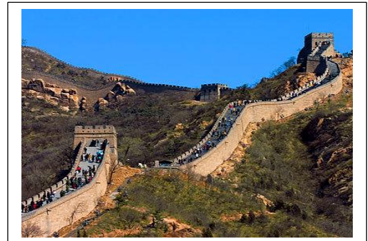
Great Wall of China

Day 4 Beijing Great Wall of China Summer Palace Tai Chi Lesson Chinese Kong Fu Show (evening) Hotel in Beijing